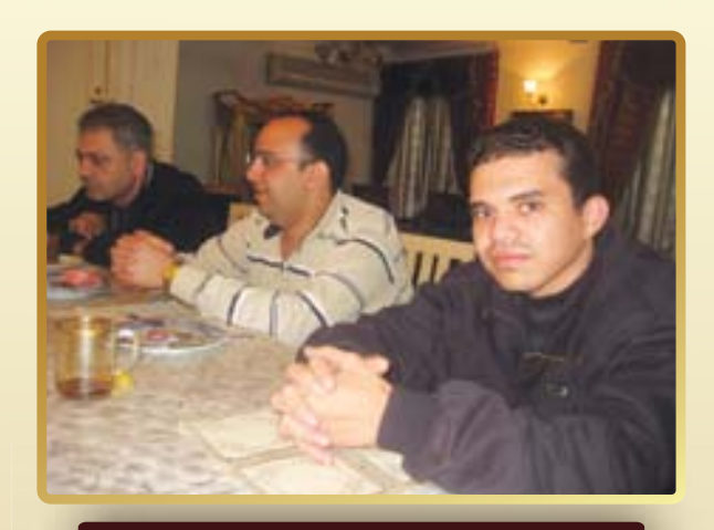
Students at table fellowship after a hard day

Programs in Biblical Studies (BS) and Christianity in the Middle East (CME) permit students a choice of emphasis for theological and spiritual growth. The BS program develops students ability to use their Greek and Hebrew to penetrate scripture and other ancient texts to greater depth. The CME program introduces Coptic to allow students better to relate to the history of the church in Egypt.